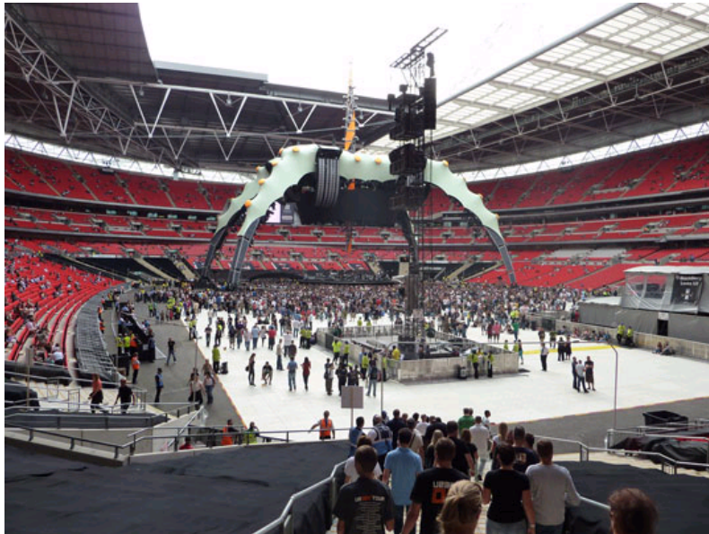
terraflor® and terratrak® being used as pitch protection, U2 concert, Wembley.

Stocks will arrive at TPA's main Worksop depot during July, enabling them to supply the tail end of the summer event season, as well as equipping the marquee industry for the Christmas festivities.