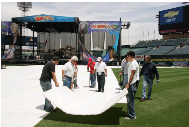
terraflor® being installed.

terratrak plus®, the culmination of 20 years industry related research and development, is a second generation product used widely by sporting stadiums, and concert promoters as their trusted turf protection system. This unique product can be placed and removed by hand and is capable of supporting weights of up to 150 tonne making it ideal to support cranes and heavy fork lift trucks during concert load- in and load- out.